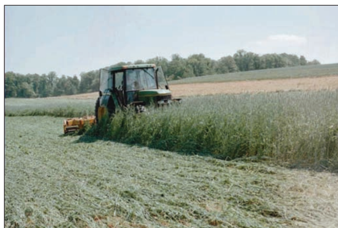
Cereal ryegrass rolled before planting soybeans. Some farmers drill soybeans directly into the cereal rye then spray the cereal rye after the soybeans emerge. The cereal rye helps to control weeds and hold soil moisture going into the summer.

recycled for the following corn crop but depending upon the C:N ratio, may tie up nitrogen short-term, hurting corn yields.